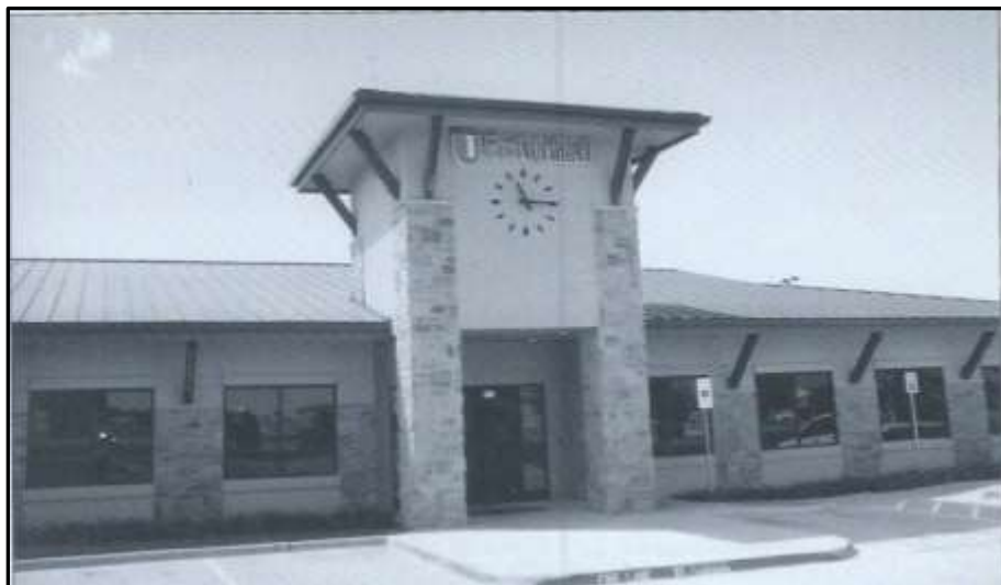
First United Bank-2008