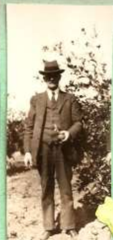
Dad on a trip to the Valley