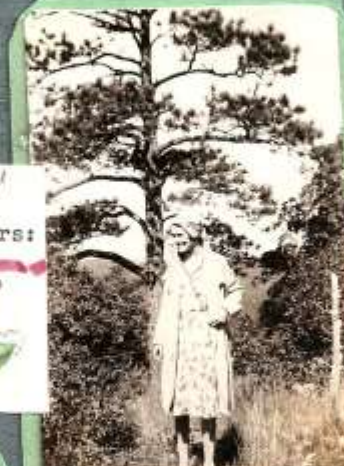
Grandchildren who worked in the Bank thru the years: