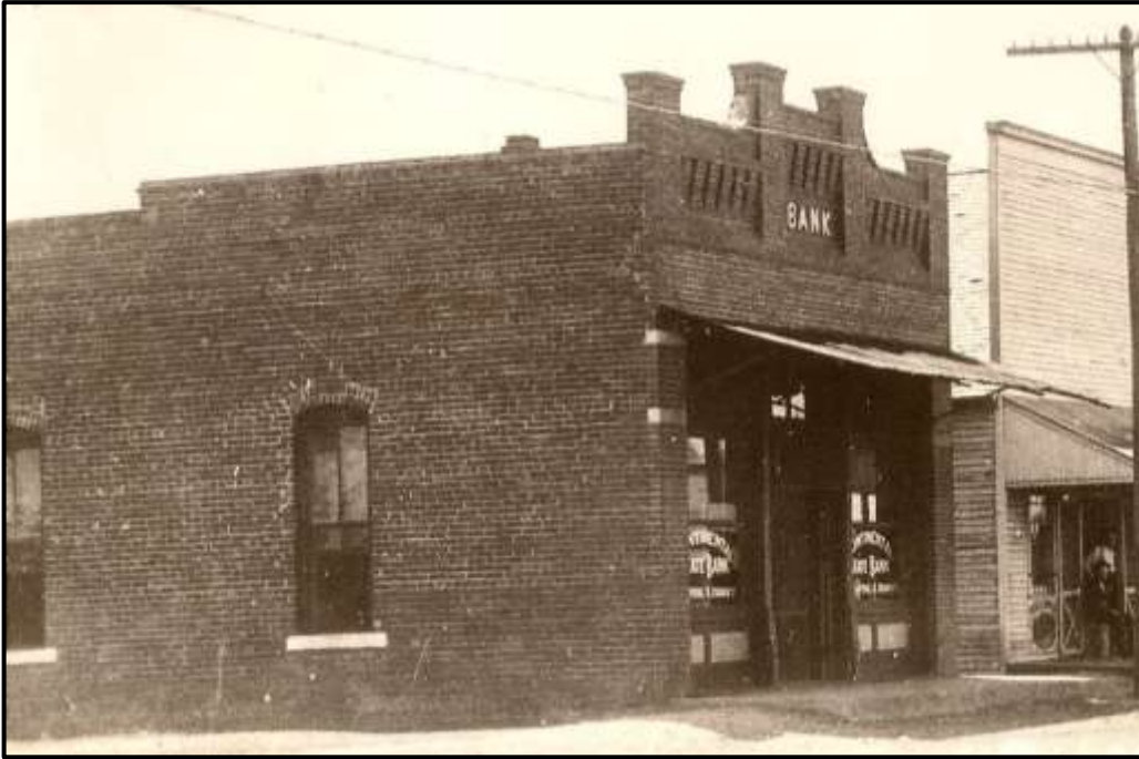
Continental Bank & Trust Est. 1905