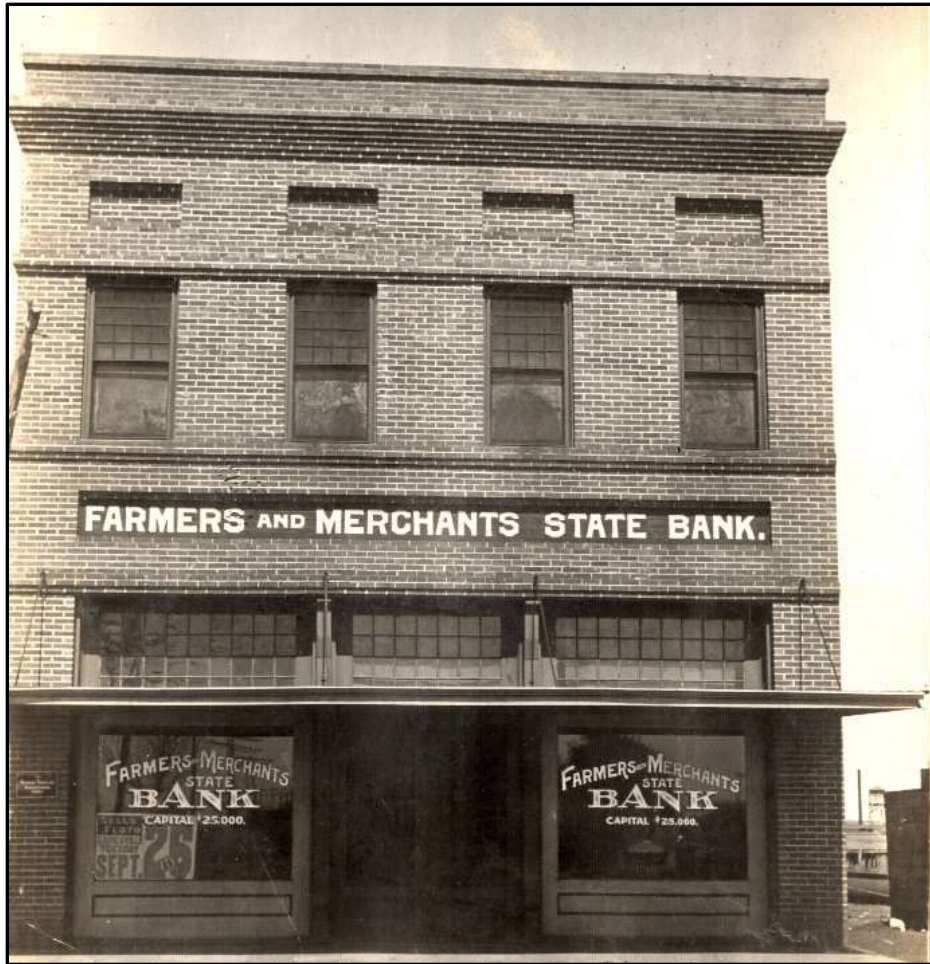
Farmers & Merchants State Bank