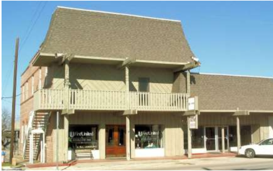
During the 1970's renovations were done on the F & M bank and a façade put on the front.