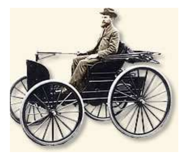
1893- Charles Duryea in the brothers' first car

Please visit the Krum Heritage Museum online at www.krumheritagemuseum.com Also please visit the Bob Muncy web site for additional information & photos on Krum & Krum families: http://www.webspawner.com/users/krumhistory/index.html