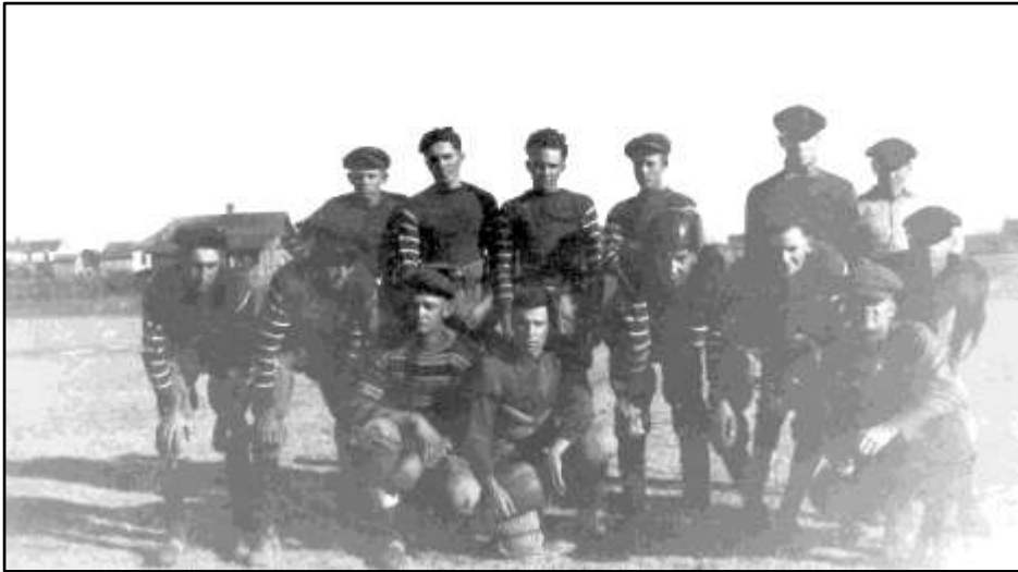
Krum Football Team 1922