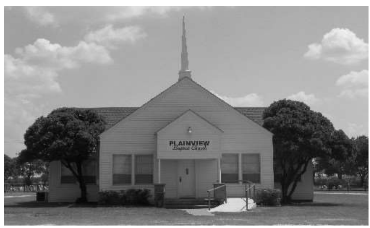
Plainview Baptist Church 2010