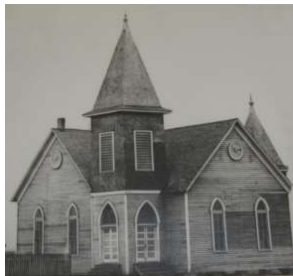
Methodist Episcopal Church South