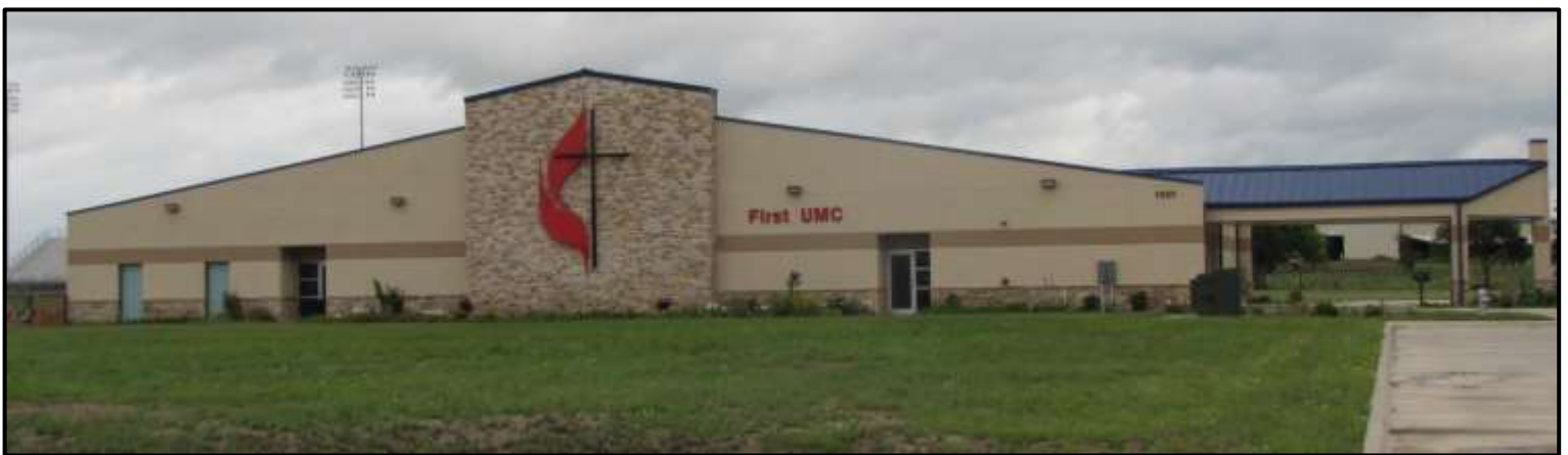
First United Methodist Church today