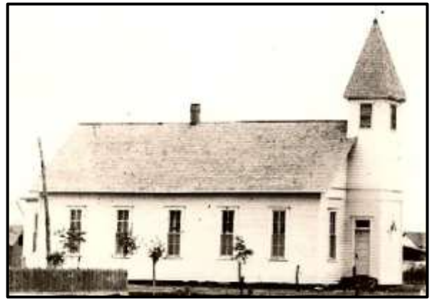
Old Baptist Church Ca 1900-1910