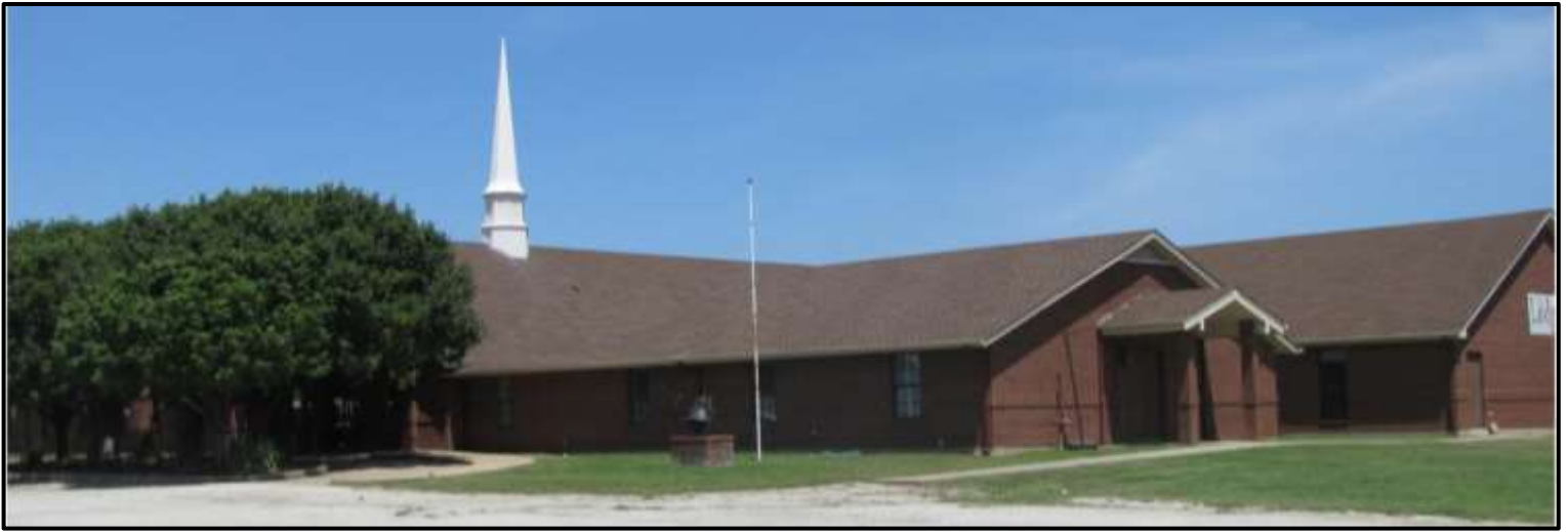
First Baptist Church today

Church of Christ: The Church of Christ in Krum is an offspring of the Church of Christ in Bolivar. In 1893 it was agreed for the members of the Bolivar Church who lived south of Clear Creek to meet in Krum. The congregation was organized in the little one room building that was serving the community as both school and Methodist meeting house. Services were conducted in the school until 1899, when the lot where the church now stands at Third and Huffman was bought and a church built.