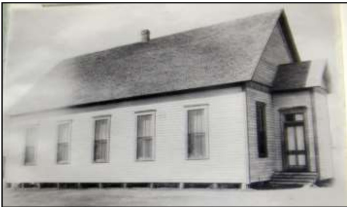
Church of Christ-old & new

Church of Christ: The Church of Christ in Krum is an offspring of the Church of Christ in Bolivar. In 1893 it was agreed for the members of the Bolivar Church who lived south of Clear Creek to meet in Krum. The congregation was organized in the little one room building that was serving the community as both school and Methodist meeting house. Services were conducted in the school until 1899, when the lot where the church now stands at Third and Huffman was bought and a church built.