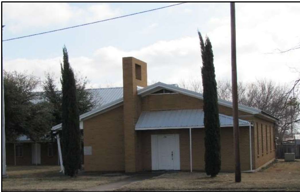
Baptist Church -2nd